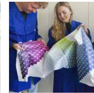
Colour Measurement Laboratory