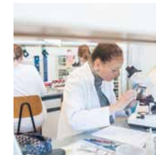
Textile Materials Laboratory