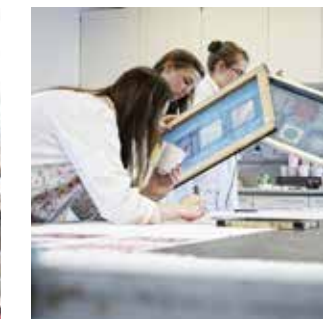
Textile Printing Laboratory