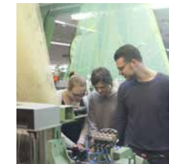
Weaving and Fabric Laboratory